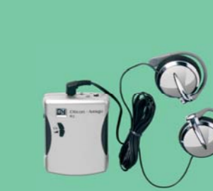
Amigo R5 can be used with headphones for those diagnosed with CAPD.