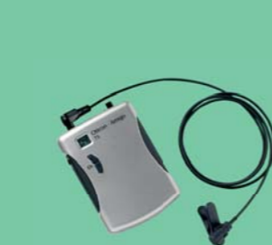
Amigo T5 has three different microphone options depending on your need: - Directional lapel - Omni directional lapel - Boom