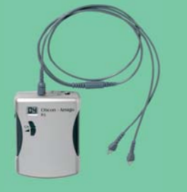
By connecting a DA1 cable to the Amigo R5, you can use it together with a hearing aid.