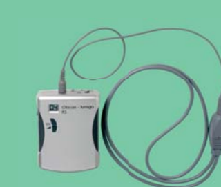
The Amigo R5 offers an optional neck-loop for those using a Telecoil.