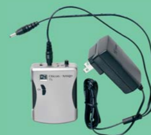
Amigo T5 and R5 come with a wall charger that can charge 2 units simultaneously.