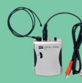
The Amigo T5 can be connected to external audio sources (such as a TV, PC or MP3 player) with the aid of auxiliary cables.