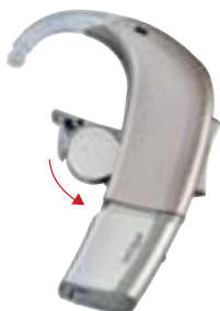
Close the battery door