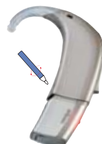
Lock the battery door