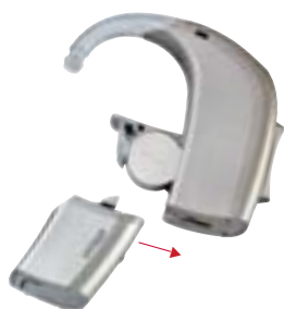
Slide Amigo R12 on

Oticon has taken an open systems approach to FM since we believe that FM solutions should be able to match with other systems. To give professionals this opportunity, we have made Amigo extremely flexible. Its frequency response and compression strategies are compatible with most FM systems available. Also, schools will not have to exchange entire inventories of equipment, as Amigo offers the full range of benefits when used with older FM products.