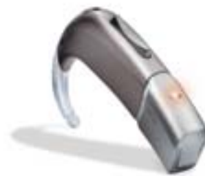
Oticon Vigo and Amigo R12 actual size

With its 7.5 kHz bandwidth, the Amigo R12 solution provides good access to the speech cues the child needs to hear and can help improve comprehension at school.